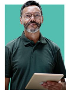
Changing or Losing a Job