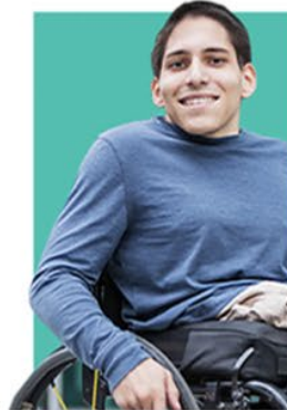
Starting a Job