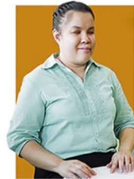
Maintaining a Job