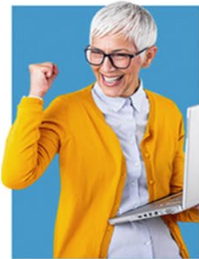
Retiring from a Job